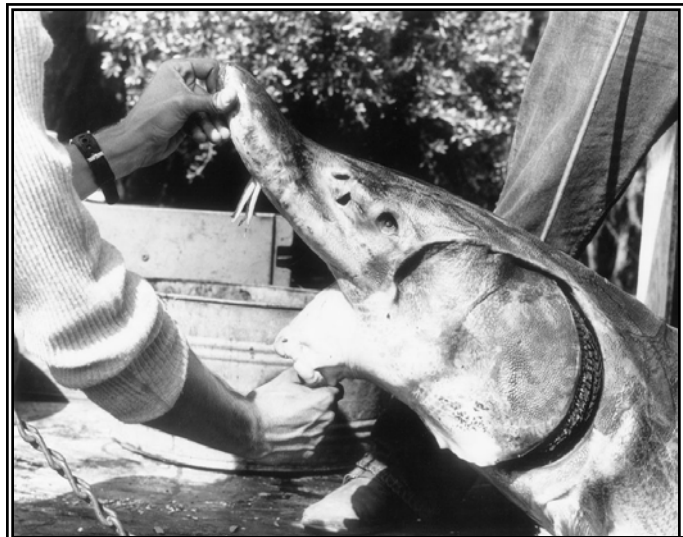
Note the whisker like sensory barbels and the biologist’s thumb is in the extensible, sucking mouth of the sturgeon.

Gulf sturgeon spawn in several panhandle rivers as well as the Suwannee. In the Apalachicola River, since the mid 1950s, the Jim Woodruff Lock and Dam and diminished water flows coming from Georgia have cut off one of the major reproductive grounds for this threatened species. The U.S. Fish and Wildlife Service recently issued a biological opinion related to operation of Federal Reservoirs by the U.S. Army Corps of Engineers to help ensure continued existence and recovery of the Apalachicola River sturgeon. Meanwhile, the debate over how much water is released into the Apalachicola River from upstream is the subject of continuing lawsuits and negotiations between Alabama, Georgia and Florida. Populations appear to be increasing in the Suwannee and Choctawhatchee Rivers, with the Apalachicola River population appearing to have a more cyclical increase and decrease in year classes, perhaps related to the dam’s water release schedule and water flow rates.