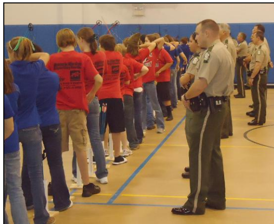
Archers and lane judges (FWC Officers) at the 2011 NASP Florida State Tournament