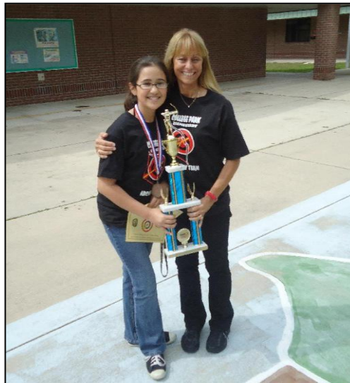
2011 Tournament awards ceremony at College Park Elementary in Ocala

the live tournament, all other awards will be mailed or delivered to the participating schools.